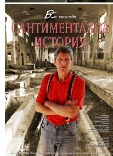
Avengress and Sentimental Story both by B Plus Films.